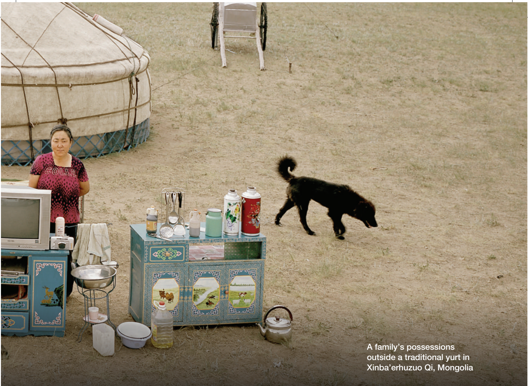
A family's possessions outside a traditional yurt in Xinba'erhuzuo Qi, Mongolia